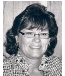
Festival of Trees Co-Chair