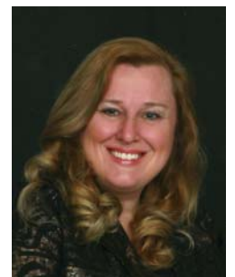
Festival of Trees Chairman

If you are interested in helping with the event, please email us at info@icmtx.org . The next meeting for those interested in volunteering for the festival is November 8, 2010, at 7:00 PM at the ICM office located at 151 Park Avenue in League City.